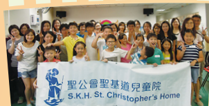
工作坊開始前，先玩破冰遊戲，再影一張大合照。 Ice-breaking game and group photo

The Home's social enterprise Good 4 Life hosted the Workshop. Under the guidance of professional instructor and deprived mothers, sponsors and children made non-additive skincare products together.