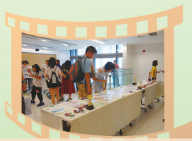
兒童參與活動的證書和獎狀展覽 Exhibition of children's certificates and trophies

Under the three years' support from Cheung Hing Wah Charitable Foundation, the Home's children obtained the chance to develop multiple intelligences and pursue their dreams. Taking the opportunity of the Award Ceremony, children demonstrated their talents and shared their accomplishments with the sponsors by performing on stage.