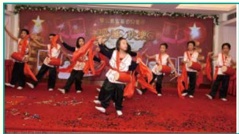
兒童表演腰鼓舞 Children's dance performance

Sponsors joined the Home's annual Christmas Party and shared the happiness of Christmas with our staff and children.