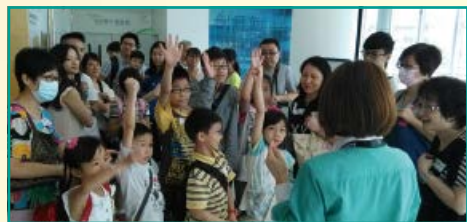
兒童搶答科學園導賞員的問題 Children enjoyed the quiz!

當天連同本院兒童，一行百多人，參觀了科學園的不同展館。其後，本院社企「生活·好點」職員簡介社企理念及店舖運作，而參加者則享用店內的飲品及小食，大家都盡興而歸。