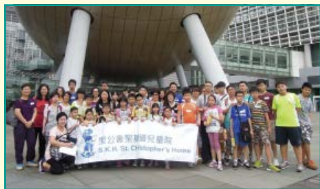
大合照 Everyone cheers!

More than one hundred sponsors and children joined the gathering on that day. They visited different exhibition areas in the Hong Kong Science & Technology Parks. After the tour, staff of "Good 4 Life" introduced the operation of the shop. Participants were served with snacks and drinks provided by "Good 4 Life". Everyone enjoyed the fantastic day.