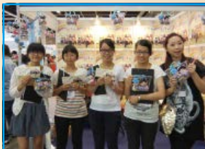
多謝義工們的熱心幫助！ Sincere thanks to all volunteers!

With the big assistance of sponsors and their family members as well as other volunteers, we had recruited nearly 100 new sponsors at the annual BB expo.