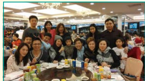
兒童與助養人見面 Children and sponsors met in the party

Two sponsor's functions were organized in 2014/15: