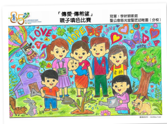
「傳愛·傳希望」親子填色比賽冠軍作品 Coloring contest for children and parents

服務單位也各有不同的院慶活動，例如聖基道幼兒園（葵涌）邀請學生和家長參與「縫製百家布·承載滿祝福」和「愛與夢·飛行85載」短片拍攝大賞。寄養服務及童行有愛——幼稚園駐校社工服務均舉行填色比賽，分別予全港寄養兒童及各幼稚園學生和家長參與。