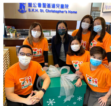
7-Eleven送來的聖誕驚喜 A Christmas surprise from 7-Eleven

Deep gratitude to 7-Eleven, the Community Chest, K for Kids Foundation, Prime Time Toys Ltd., as well as many other caring groups and donors for offering the Home's children gifts, coupons, food, toys, etc., to celebrate the festive season. 童