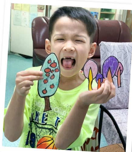
兒童製作短片道具 Child made prop