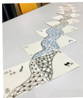
同工合作而成的禪繞繪畫 A collective Zentangle art by staff

疫情起伏不定，大家都度過了非一般的2020年。外在的限制，難免會對我們的日常生活和心靈造成負面影響，即使是難得的85周年院慶活動亦無法倖免。感恩在共同努力和互相支持下，我們總算平安度過這一年，並發揮出集體智慧、愛與忍耐，一起克服挑戰，甚至突破常規，走出新的方向。這種迎难而上的態度，正正是聖基道85年來不變的精神。