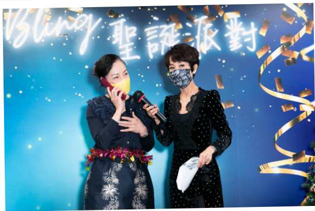
眼明手快打電話 Play game by telephone