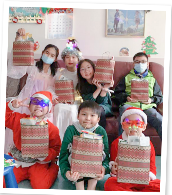
滿載而歸！ So happy!