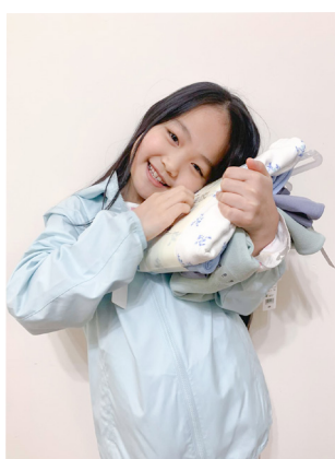
保暖新衣 Lovely warm clothing