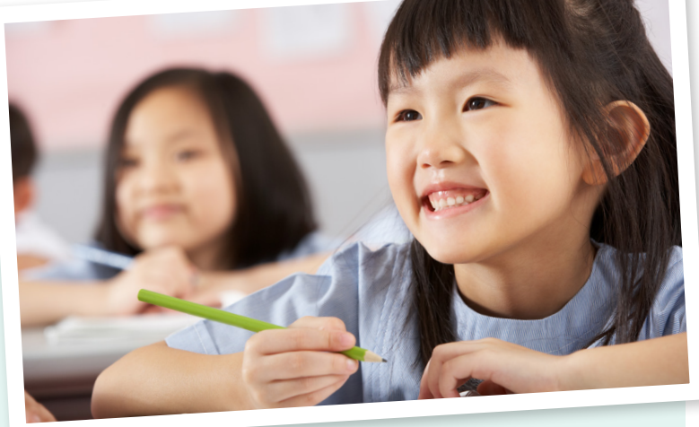
培育自信滿滿的孩子 Nurture confident child