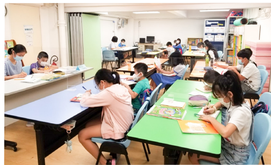
學習班組 Tuition class

Dedicated to serving children from low-income families in Shatin, Heart Link was sponsored by Computime Limited to offer members developmental workshops, academic guidance and Christmas activity through the "Multiple Intelligence Program". Despite the pandemic, 95 sessions of the four tuition classes were recorded with nearly 1,000 attendance in total over the year. 📖