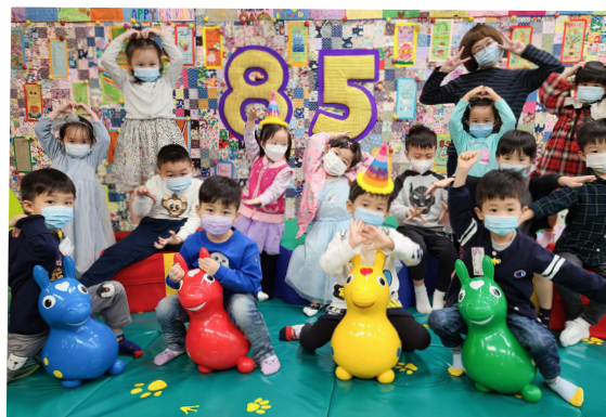
縫製百家布 Patchwork quilt

Service units also arranged various celebration activities. St. Christopher's Nursery (Kwai Chung) invited students and parents to make patchwork quilt and join the short film making competition. Foster Care Service and "To Kids with Love" - Social Work Service for Pre-primary Institutions organized coloring contest for foster children and kindergarten students as well as their families respectively.