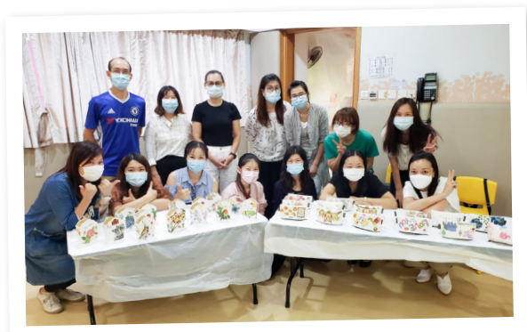
蝶古巴特藝術工作坊 Decoupage workshop

同工方面，本院舉行了蝶古巴特藝術工作坊和禪繞工作坊，供大家自由參與。透過手工藝製作及治癒心靈的繪畫活動，讓同工在忙碌的工作中，能有舒展身心靈的好機會。另外，全院每位同工更獲贈精美的85周年紀念傘和T恤留念。