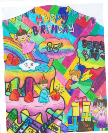
全港寄養兒童填色比賽高小至中學組冠軍作品 Winning artwork by foster child