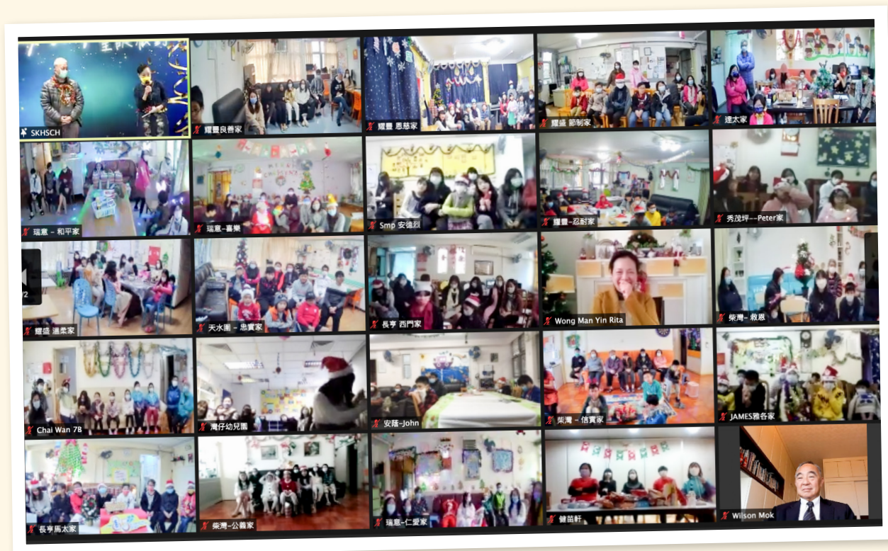
首個網上聖誕派對有近400人參與 Christmas Party on Zoom

不經不覺，我們與疫情已共處逾年，勤洗手、戴口罩、減少外出、保持社交距離等舉措，似乎已成為了全球的新常態。在這樣的大環境下，去年原定慶祝聖基道兒童院85周年的活動亦受到影響。惟有賴大家共同努力，活動皆順利完成，並以新面貌呈現出來。