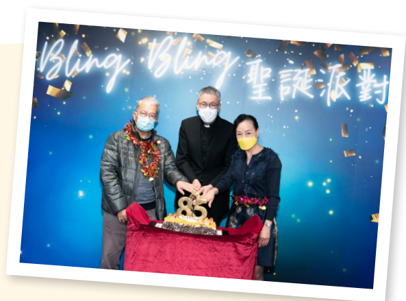
85周年院慶切餅儀式 Cake cutting ceremony