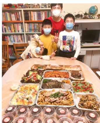
美味開年飯 New Year feast