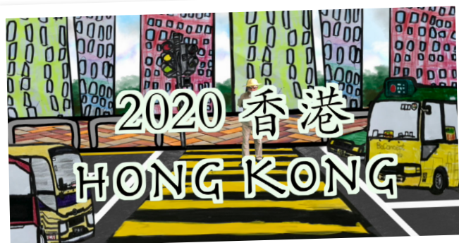
愛到這世界邊端 Faraway Love

同場還分享了瑞意兒童之家以「傳愛·傳希望」為題創作的短片《愛到這世界邊端》。故事講述兒童希希85年來遊歷世界各地，以愛行善。年邁的他最後來到香港，與兒童望望相遇，再由他接棒，承傳助人的使命。家舍兒童傾力參與演出、配音、製作道具和服飾等，效果令人讚嘆，最終贏得85周年慶典活動——短片製作比賽冠軍！