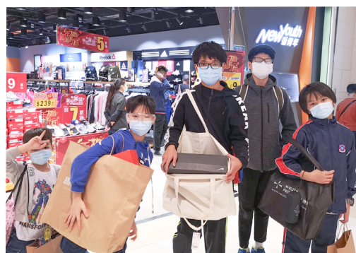
選購新鞋 Shopping for new shoes