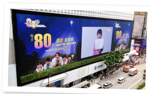
助養計劃宣傳片 Promo broadcast at SOGO

Workshops of Decoupage and Zentangle were arranged for staff to relax their body and mind through creative art activities. Attractive 85th Anniversary Umbrella and T-shirt were given to each staff member as souvenir.