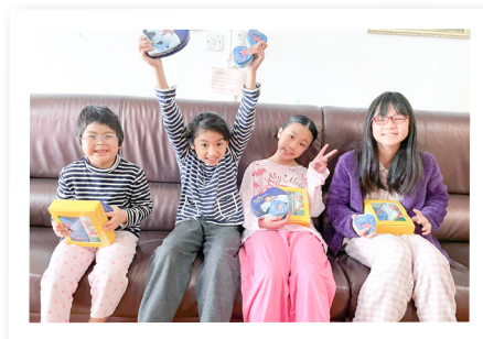
收到了！ We got your Love Chocolate!