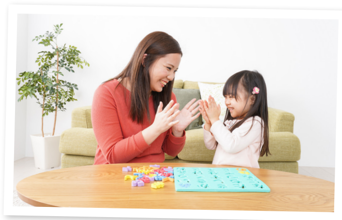
從生活中發掘子女的優點 Explore our children's strength in daily life