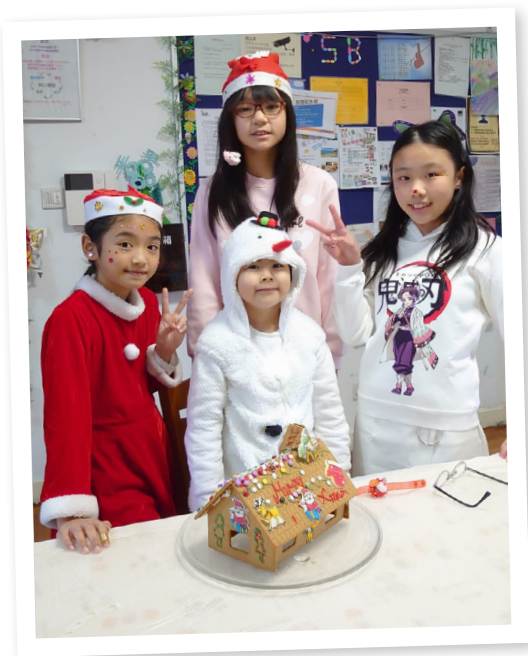
全場總冠軍柴灣公義家，兒童並以出色造型贏得「最Bling Bling」大獎 Righteousness Small Group Home won the most "Bling Bling" costume award and overall champion

不過，這難題卻激發了創意和應變能力。同工們將這個年度盛事改為本院85年來第一個網上聖誕派對，讓院內接近400位成員安在家舍或辦公室等地方，透過遠程會議軟件Zoom參與其中。習慣了網上學習的兒童更主動發送聊天訊息，無礙交流。