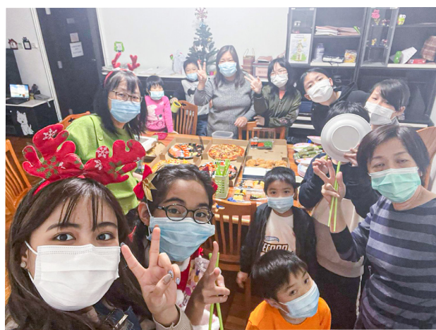
聖誕派對 Christmas party