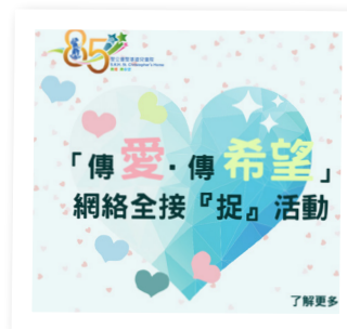
嘉年華改為網上慶祝活動 Carnival changed online

拍攝祝賀短片 The Chairman's congratulations via video