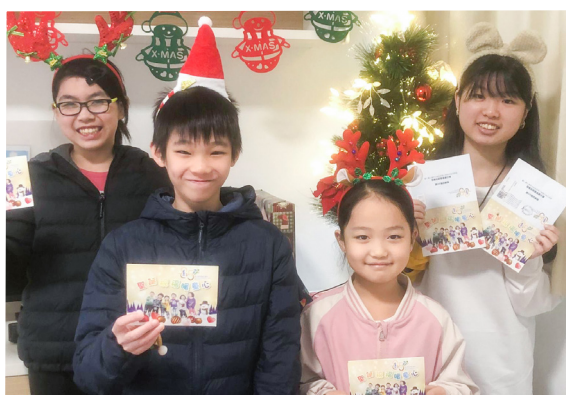
謝謝祝福！ Thanks for the blessings!