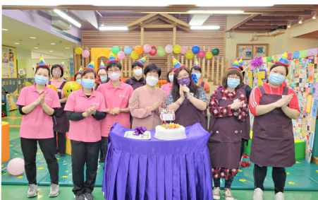
生日快樂！ Happy birthday!

聖基道幼兒園（葵涌）於3月1日舉行「15周年感恩慶祝會」，全體師生透過Zoom參與其中，場面熱鬧歡欣！伍校長表示：「這真是個不一樣的校慶，師生都感到十分開心和感恩！感謝天父一直以來的帶領，盼望葵涌幼兒園繼續培育幼苗，為主發光！」