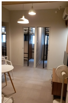
共用客飯廳 Common room

獲善長以低於市價的租金租出位於市區的住宅單位，本院得以於2020年8月起開展「T-Lodge青年共居計劃」。T是Transitional Living的簡寫，意即過渡期的生活居所，為曾接受兒童住宿服務並缺乏家庭支援的18至27歲青年提供可負擔、安全、穩定的居所，建立自立能力，準備將來開展獨立生活。