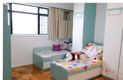
兒童學習和生活的地方 A place to learn and live

Via funding from Social Welfare Department for the Environment Improvement Program, the Home has planned to renovate all the Small Group Homes by phrases. Improvement works of the first home was completed earlier the year which provides a better-equipped sweet home for the children. 童