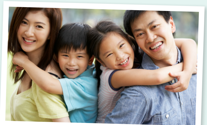
孩子在愛中塑造自我 Self-image built with love

Previous surveys indicated that it is easier for children to feel loved in harmonious family. Physical interaction with parents like hugs can let children know they are cherished so it is beneficial to their emotional wellness and personal development.